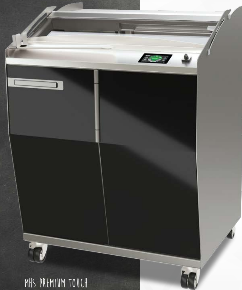
MHS PREMIUM TOUCH