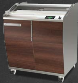
MHS PREMIUM TOUCH L