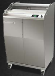
MHS PREMIUM TOUCH S